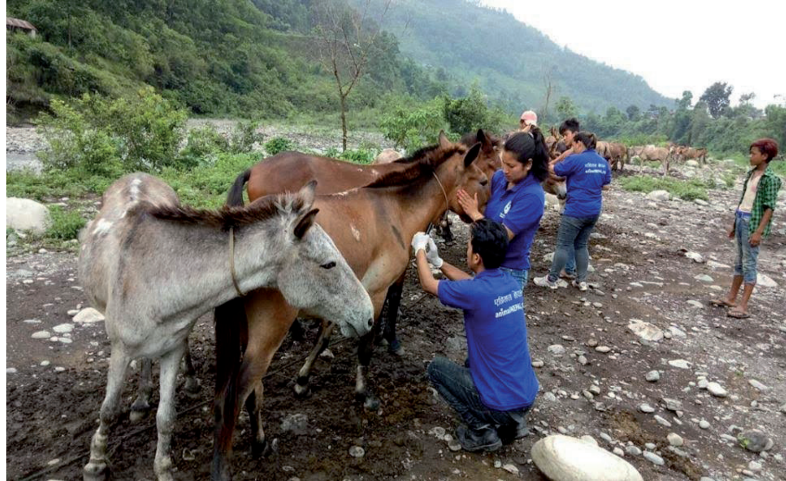
Animal Nepal staff treat mountain mules in Gorkha district

With such shelters in place, the equines have an adequate resting place with protection from any extreme weather as well as wild animals.”