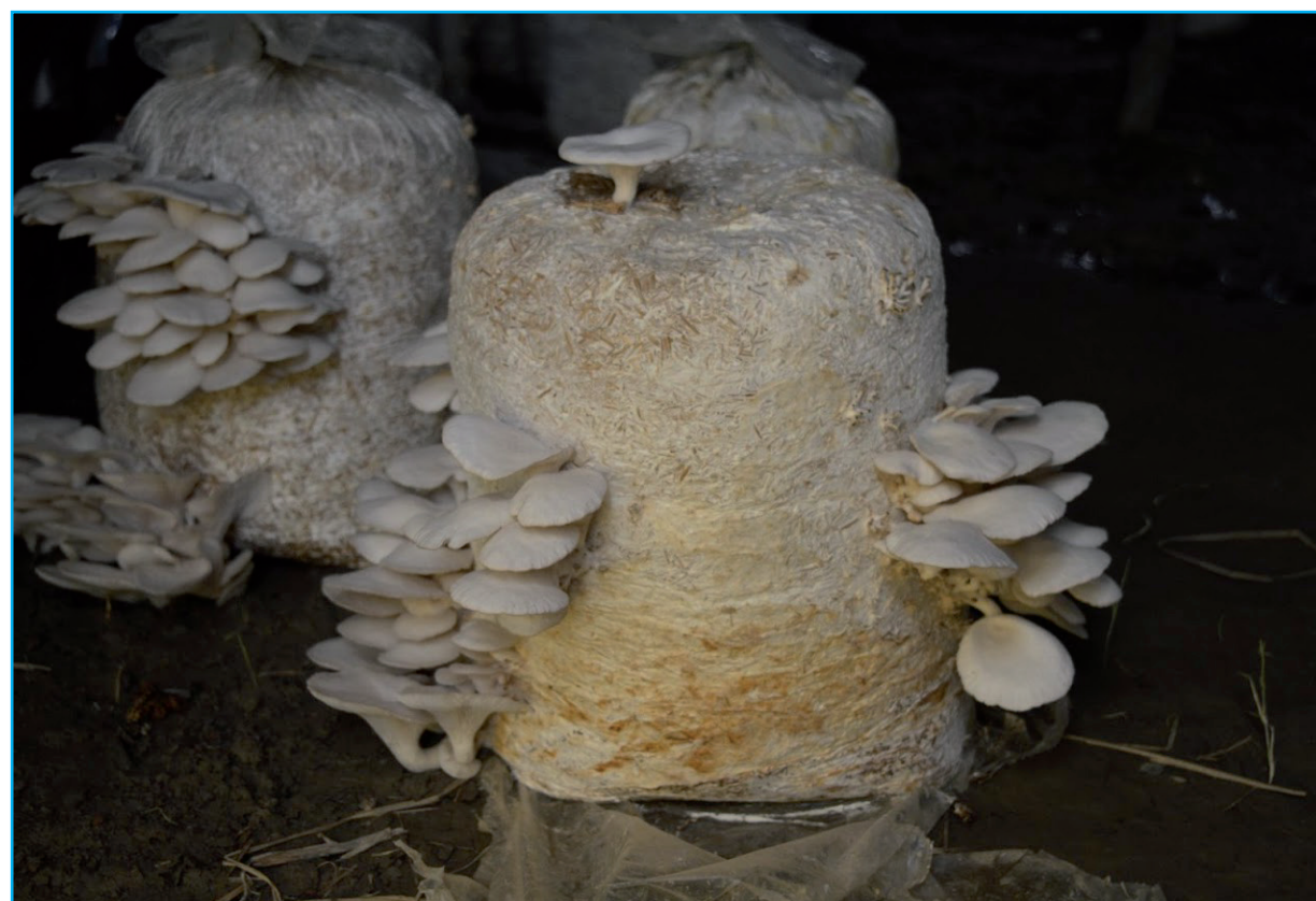
Mushrooms produced by the women of Hirminiya

In 2018, Animal Nepal's Equine Welfare Project addressed equine welfare in Hirminiya, Banke district, an area in the West of Nepal, in which the majority of the households are equine owners.