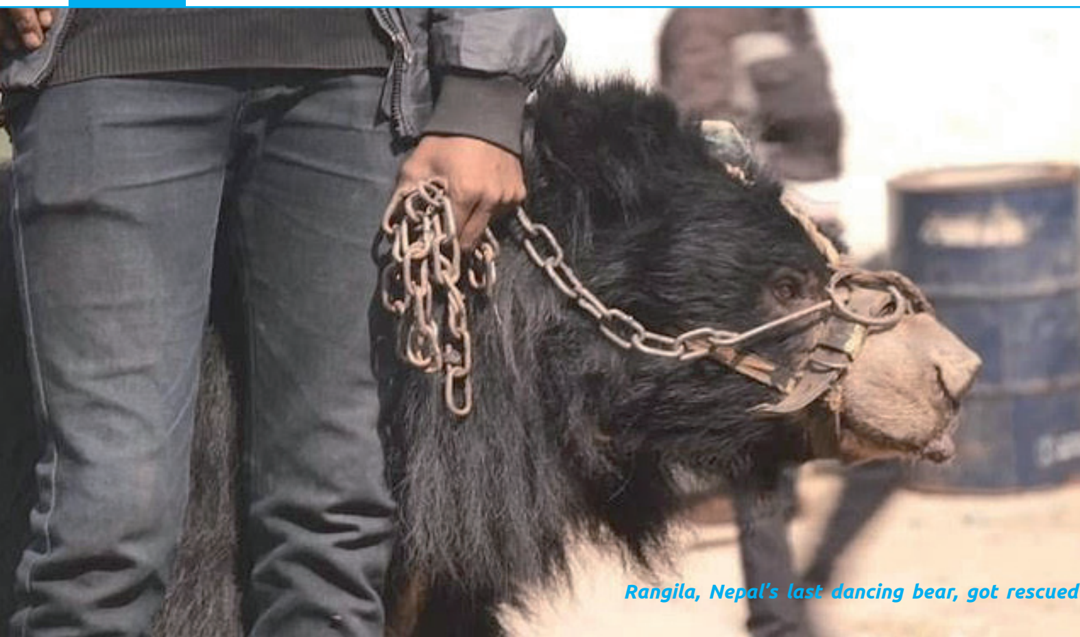
Rangila, Nepal's last dancing bear, got rescued

In October, we marked the start of Dashain (one of Nepal's largest Hindu festivals), by launching our annual campaign against the practice of Pashubali or sacrificing animals in the name of religion. We visited a number of temples across Kathmandu, putting up posters and talking to people about the need to stop animal sacrifice. In Hinduism, the practice of sacrificing animals started due to misinterpretation; Hindu scriptures such as the Gita and some Puranas in fact forbid animal sacrifice.