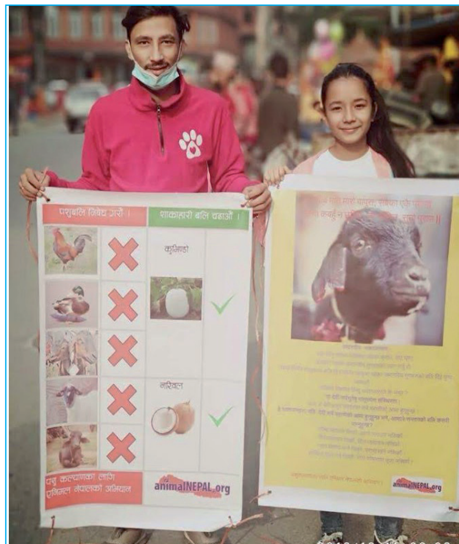
Campaigning against animal sacrifice in the heart of Patan

The full report is available on our website.