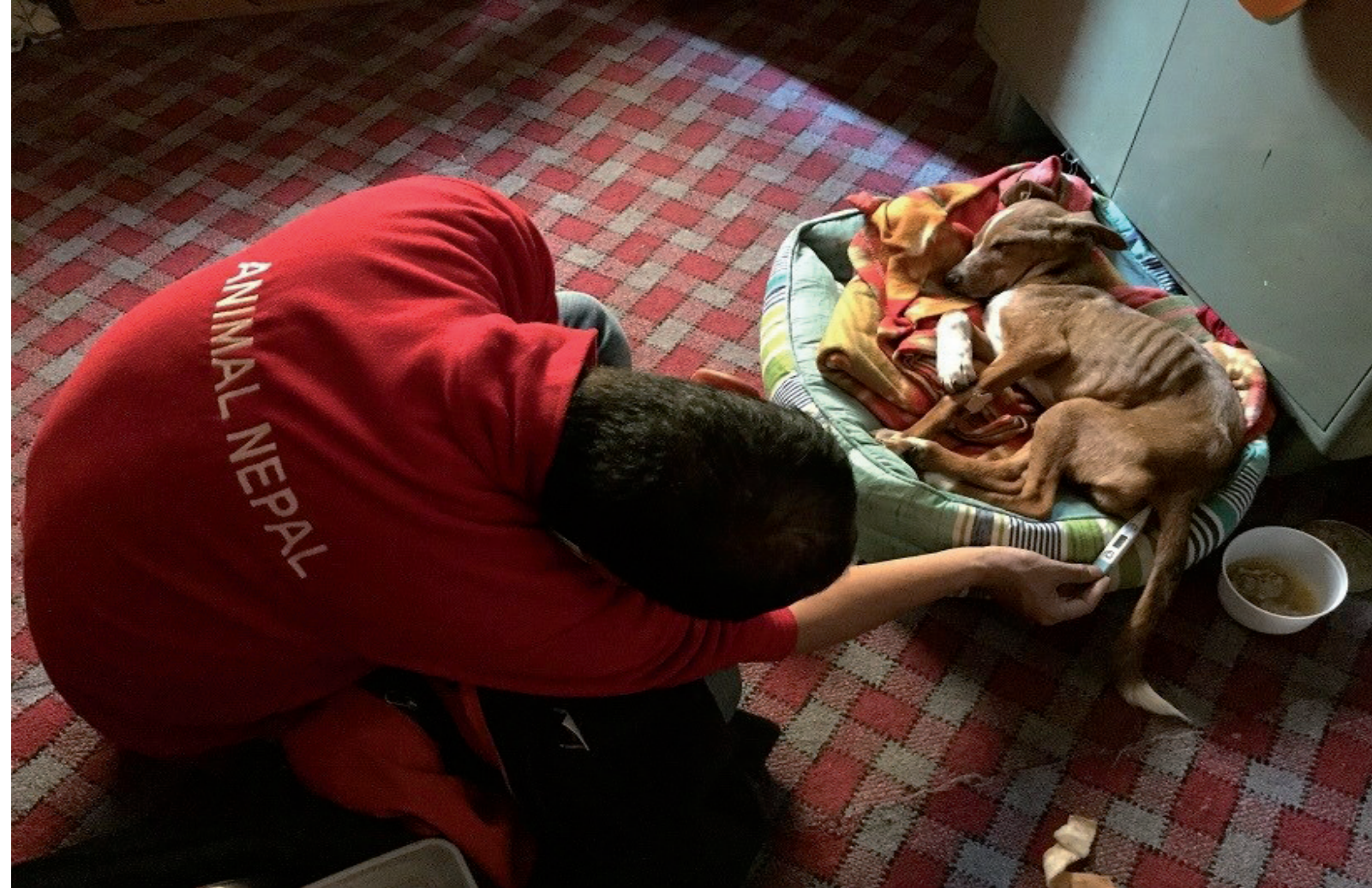
A mobile vet technician treats a sick stray dog at the home of a community member

Having our own land has been a dream come true. We look forward to transforming the space into a thriving sanctuary for our current and future residents!”